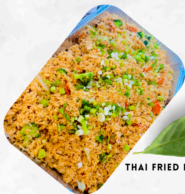
THAI FRIED RICE