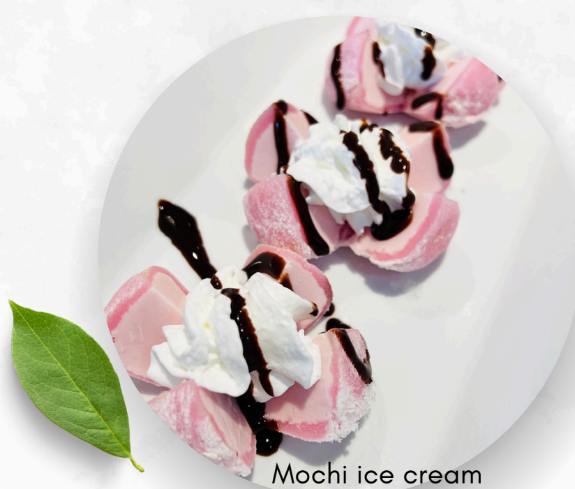
Mochi ice cream