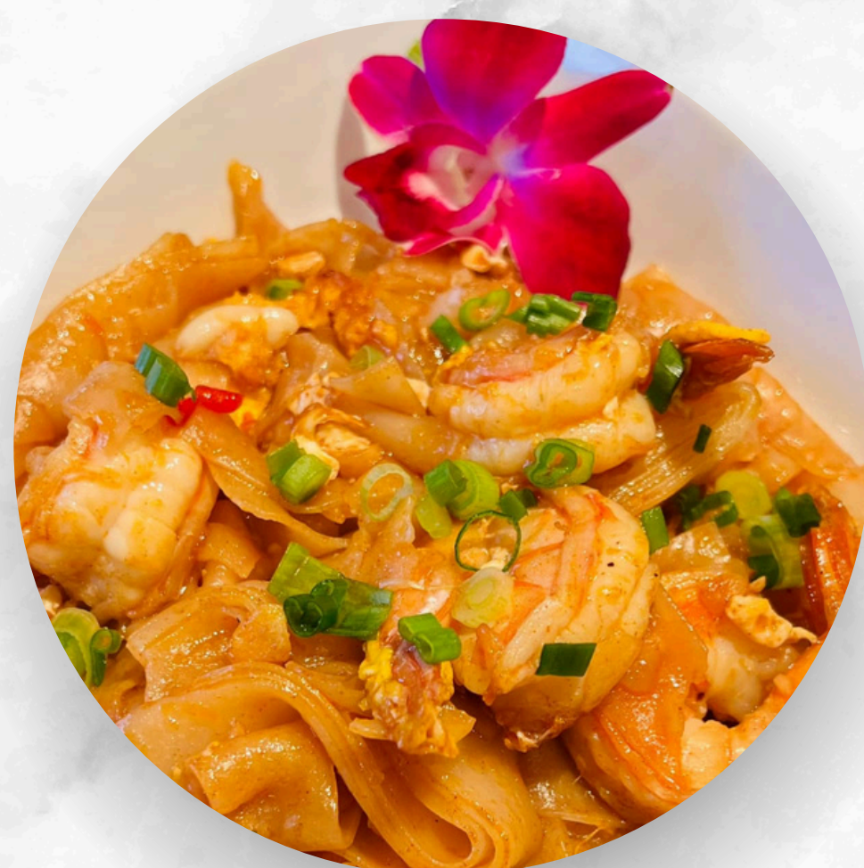
Big fresh Noodle with shrimps

Stir fried egg noodle with your choice, bell peppers, onion, carrots and broccoli.