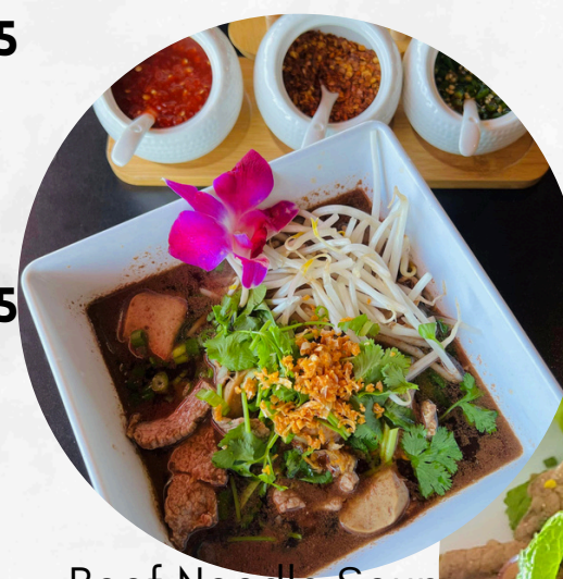
Beef Noodle Soup

Stir fried chicken, shrimps, eggs, bell peppers, onion, carrots and cashew nuts