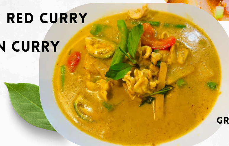
GREEN CURRY CHICKEN