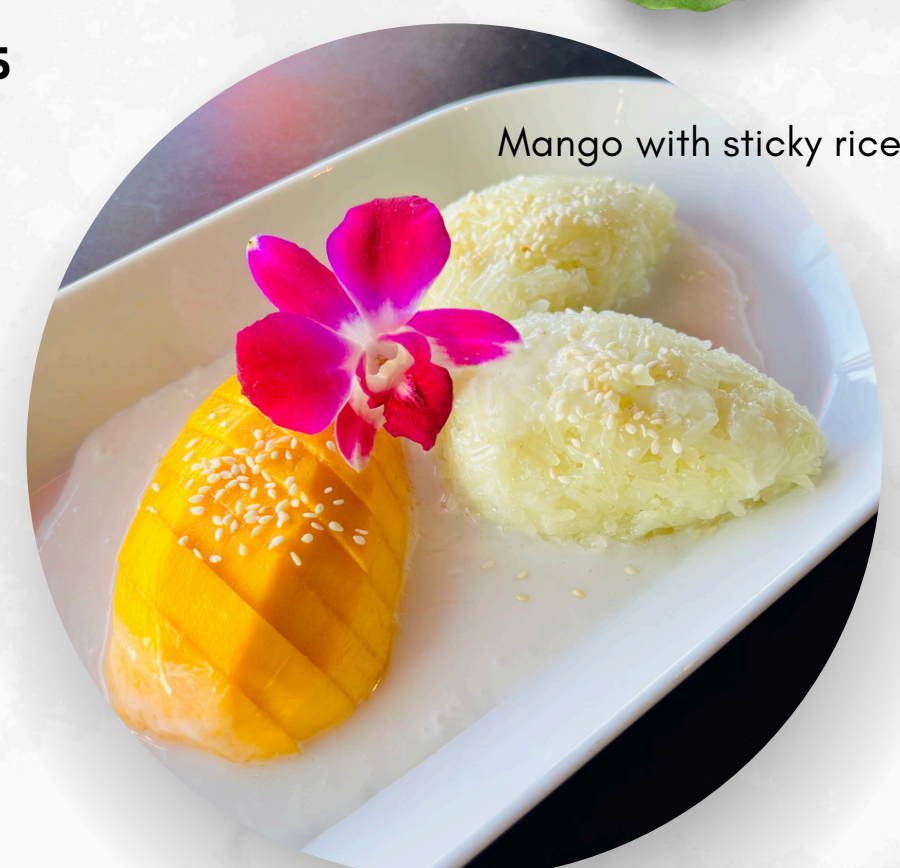
Mango with sticky rice